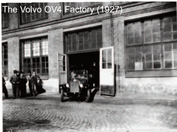
The Volvo OV4 Factory (1927)

The Volvo ÖV 4 was the first car built by Volvo. The designation ÖV 4 stands for "Öppen Vagn 4 cylindrar" in Swedish, which means Open Carriage, 4 cylinders. The model ÖV 4 has later often been referred to as "Jakob" but that was just a name for one of the 10 pre-series ÖV 4 that was ready on 25 July 1926, Jakob's name day. All 10 prototypes were assembled in Stockholm at the company AB Galco, Hälsingegatan 41 where Gustaf Larson worked at that time. Only one of the 10 pre-series cars manufactured during 1926 was saved for posterity and is housed at the Volvo Museum in Gothenburg, Sweden.